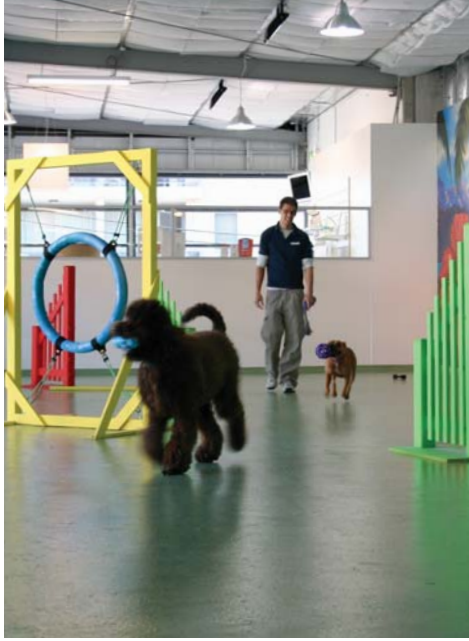
For Dogs Sake

In Sydney there are now a few options to combat boredom for home-alone dogs. They're designed to provide a stimulating and social environment for your dog and will give them a fun-filled day out from their regular routine. All require the dogs to be vaccinated (up to C5), de-sexed and in good health. They also require your dog to have an initial assessment before they're accepted into the centre. So, here's a rundown of what you might expect for your cash: