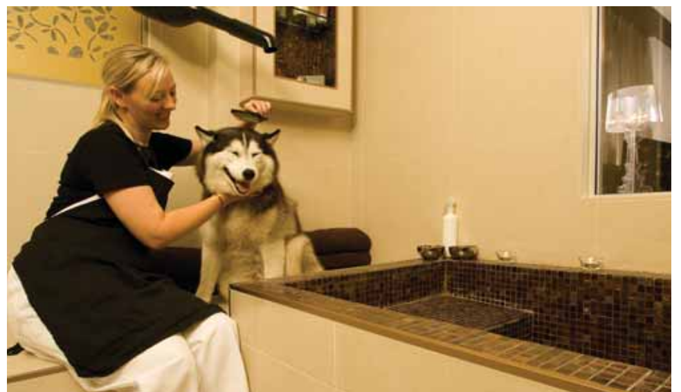
Pooch Pampering at PawPaws

But isn't your pet worth it? The new generation of dog day care and upmarket kennels are banking on it as their numbers grow despite a slumping economy. And judging by the number of pets we've seen cavorting in day care centres and lolling around the pet resort pools, there is no shortage of owners willing to give their fur kids a fun time away too.