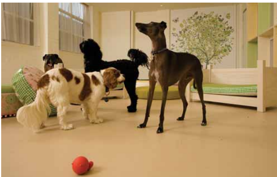
Lapping up the luxe surroundings

You'll have to fill in a multipage form on you and your dog, provide documentation of health and other aspects as required plus sign a waiver and release of responsibility. This would also be the time to check that your homeowners' or pet insurance would cover you in case your dog acts up and comes off second best as could just as easily occur in the park. Liability for dog stoushes extends to these centres just as in a public park if your dog is aggressive.