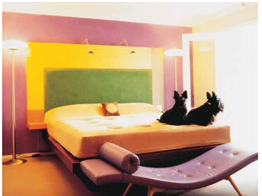
The Medusa Hotel

Ginninderry Ph: (02) 6254 6464 Email: info@ginninderry.com.au Web: www.ginninderry.com.au