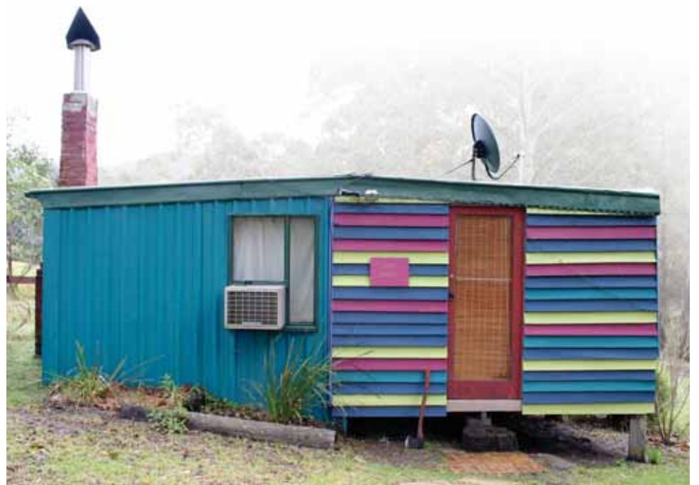
The Lazy Curl

The Lazy Curl-Wheelbarrow Road, Milton NSW 2538. Ph: (02) 4455 2290