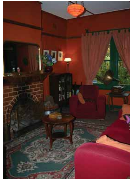
The Fibro Majestic