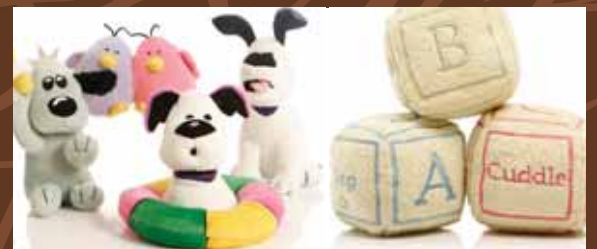
COOL MUTT STUFF

ONLINE STORE & ONLINE COMMUNITY SITE NOW ONLINE